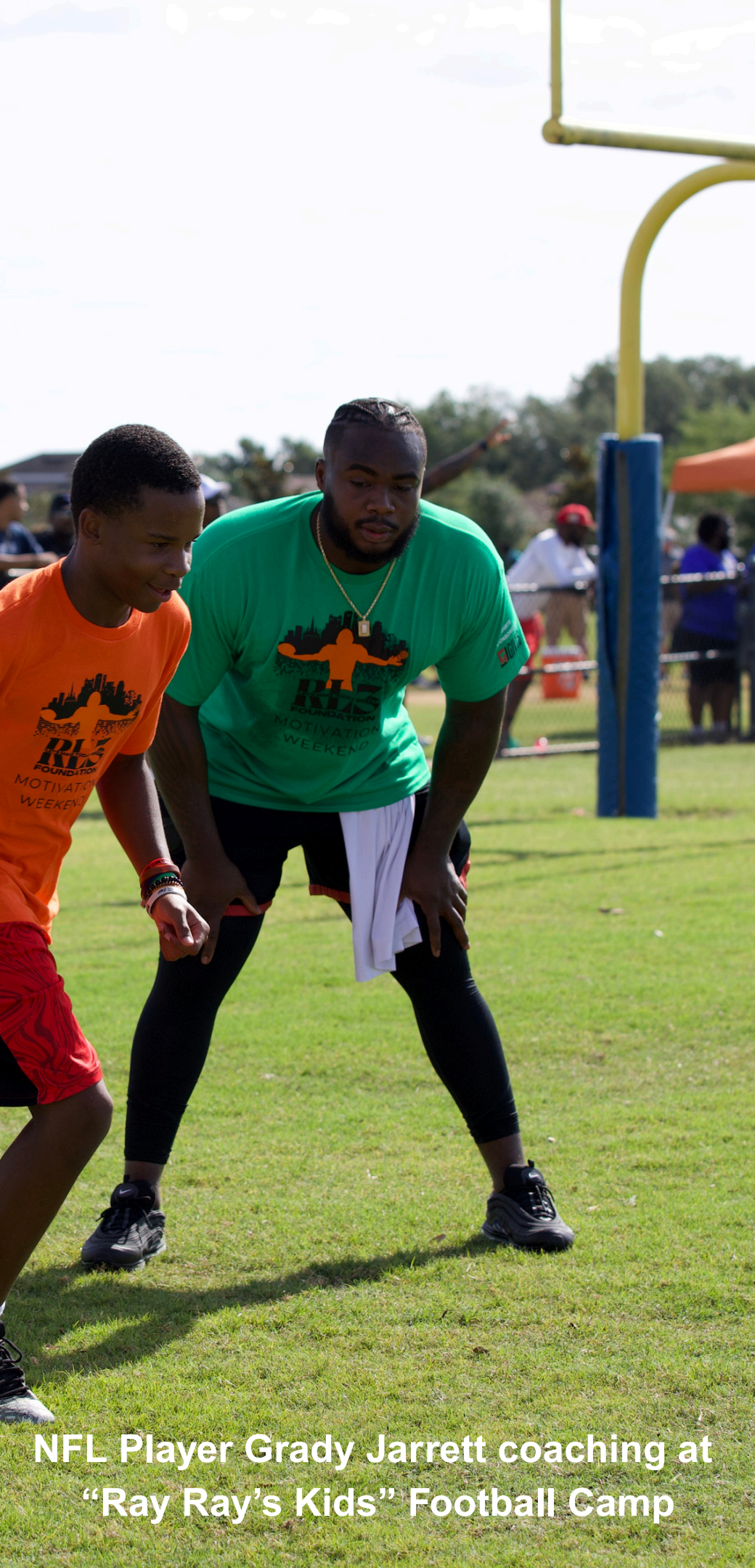
NFL Player Grady Jarrett coaching at “Ray Ray’s Kids” Football Camp