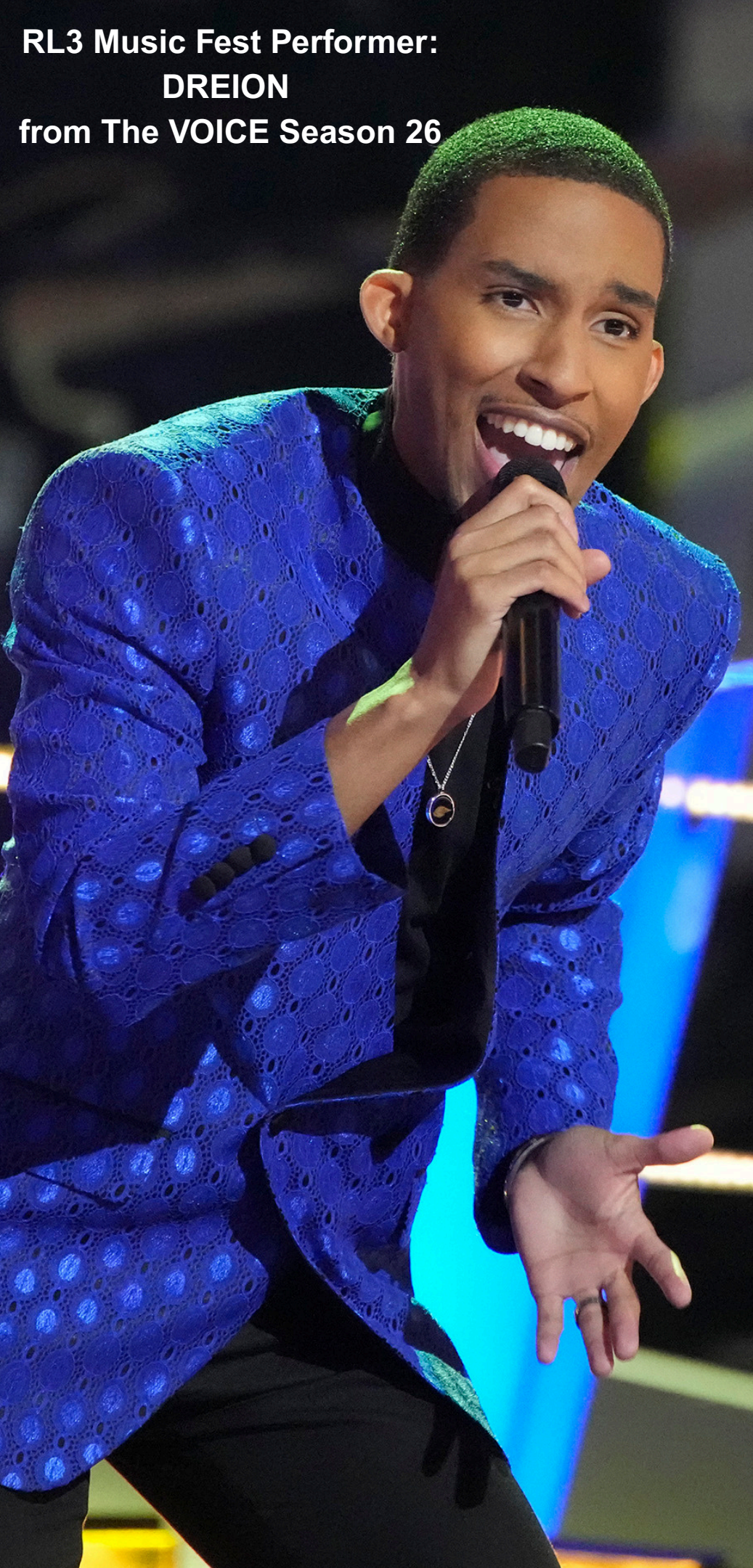
RL3 Music Fest Performer: DREION from The VOICE Season 26