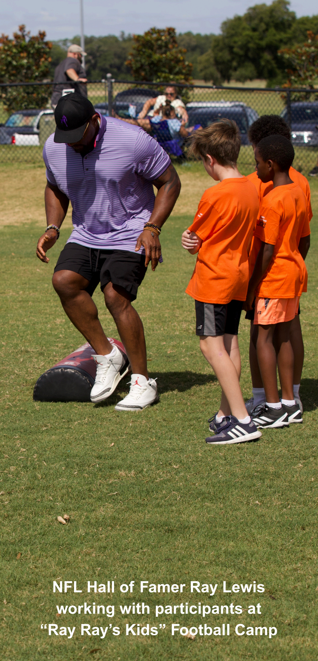
NFL Hall of Famer Ray Lewis working with participants at “Ray Ray’s Kids” Football Camp